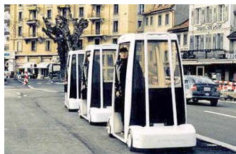
Peoplemover System, Switzerland